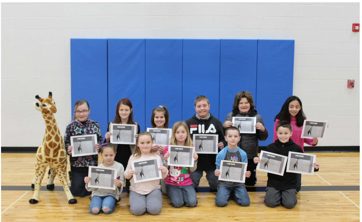
Respect Featured Reachers