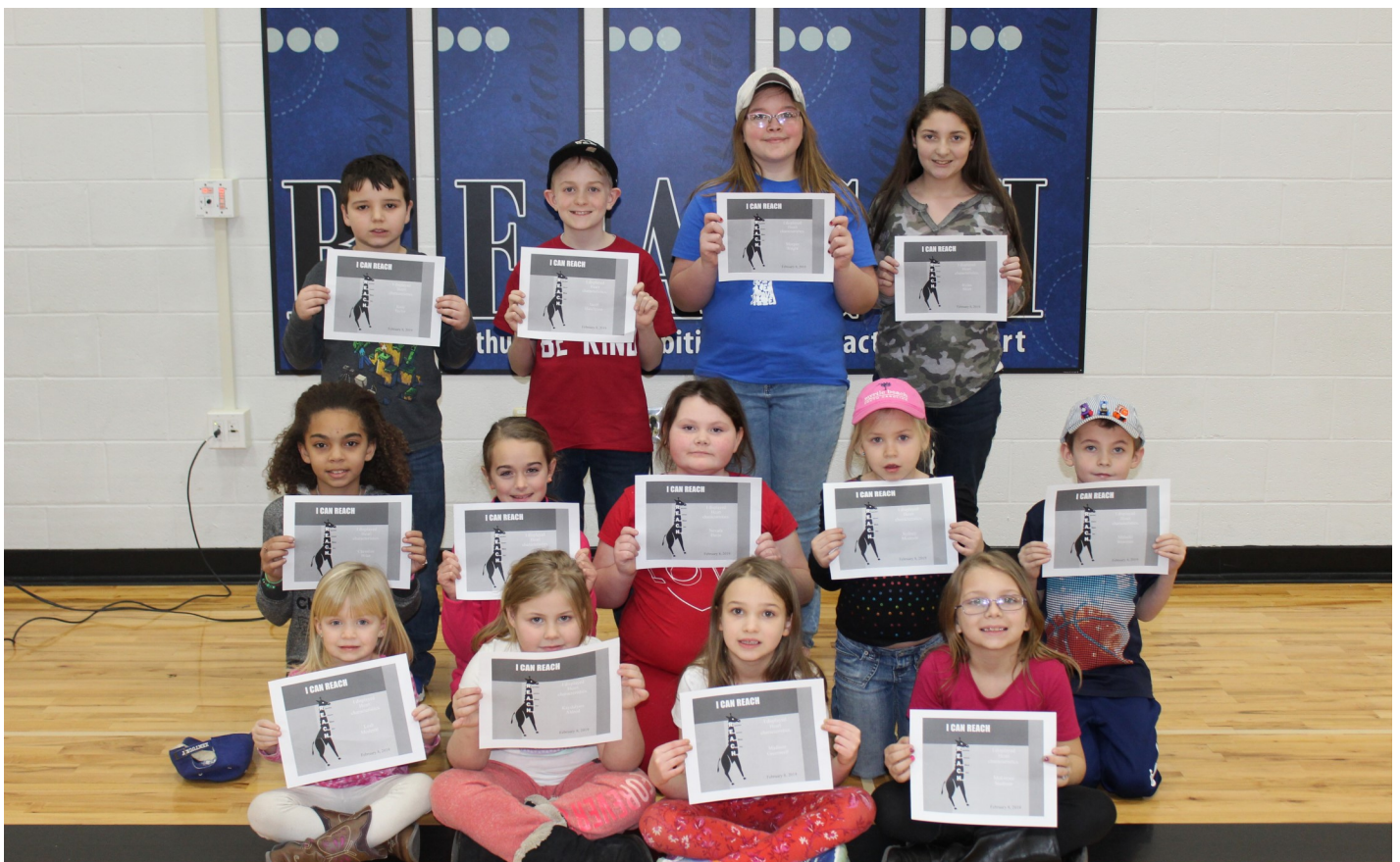
Heart Featured Reachers