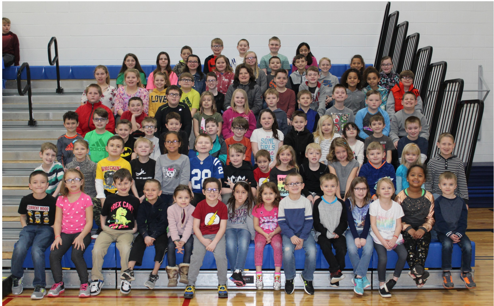
February Perfect Attendance