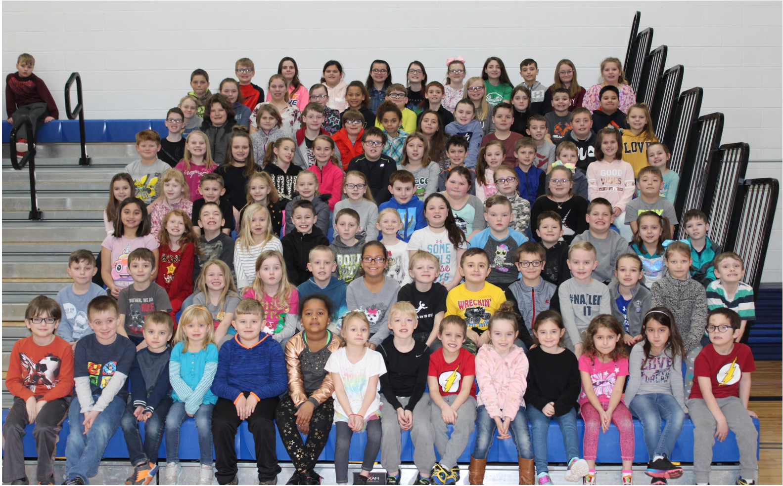
January Perfect Attendance